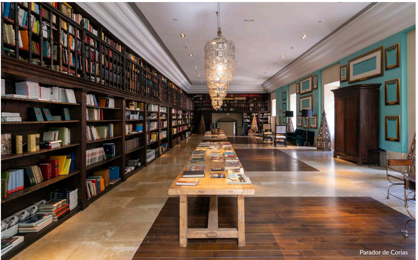
Parador de Corias

We maintain strategic alliances with nationally and internationally renowned entities, which reinforce our commitment to sustainability and continuous improvement. These include the Spanish Network of the United Nations Global Compact, Forética, EUROPARC-Spain, the World Heritage Cities Group, the Oceanogràfic Foundation of Valencia, the Global Nature Foundation and the Spanish Red Cross, among others. These collaborations enable us to advance our environmental, social and cultural objectives, as well as strengthen our role as an active player in the achievement of the 2030 Agenda.